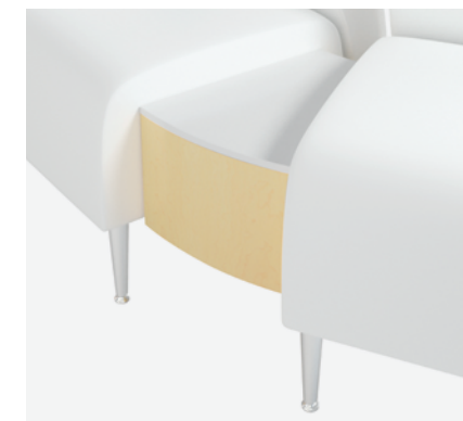
CORNER TABLES A variety of curvilinear corner tables gives Zola the ability to accommodate any space with virtually an endless amount of configurations.