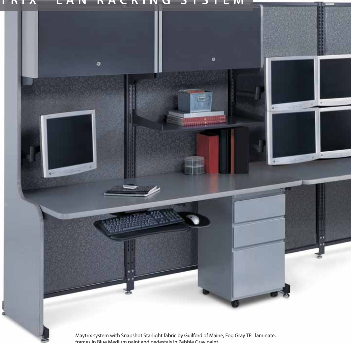
Maytrix system with Snapshot Starlight fabric by Guilford of Maine, Fog Gray TFL laminate, frames in Blue Medium paint and pedestals in Pebble Gray paint.