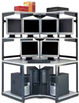
211CNR Corner Unit