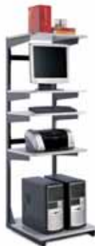
21145 24" Server Station