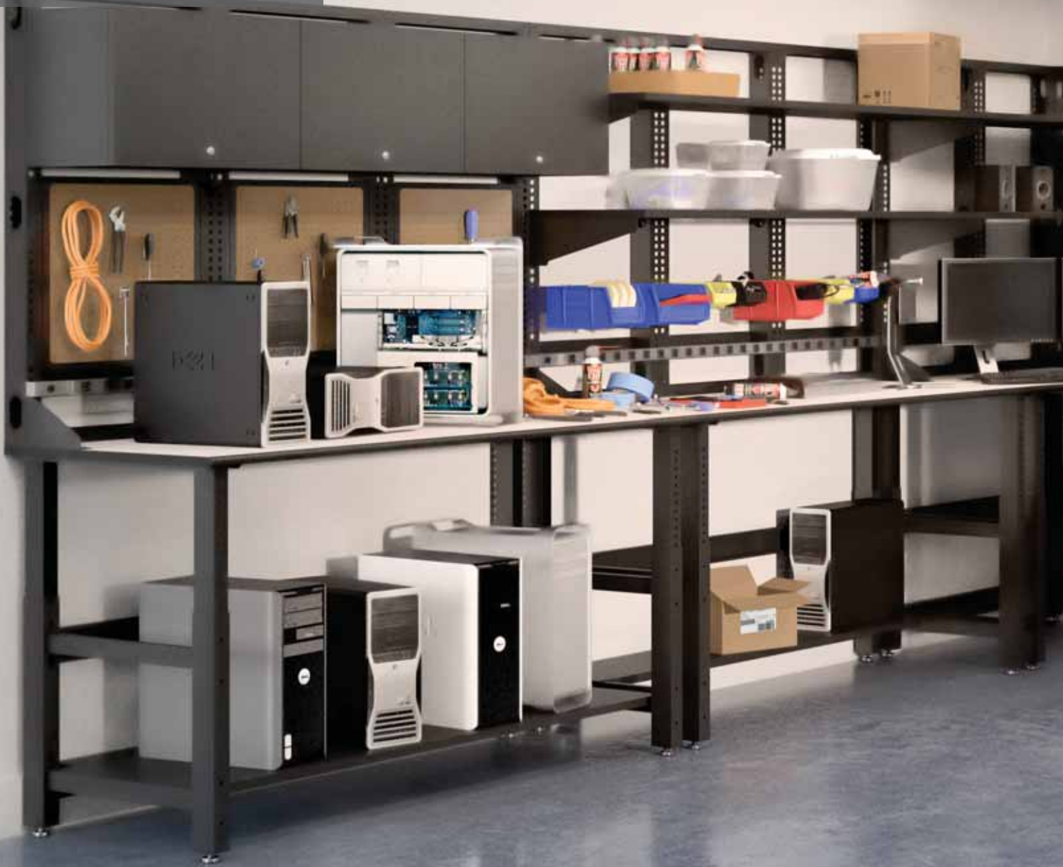
TechWorks system with Nebula Gray HPL laminate and Textured Graphite paint.