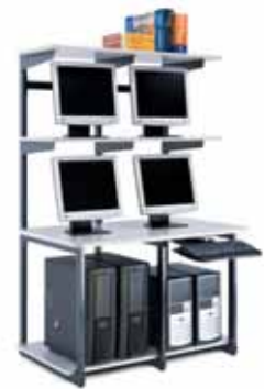
21148 48" LAN Station with optional keyboard support