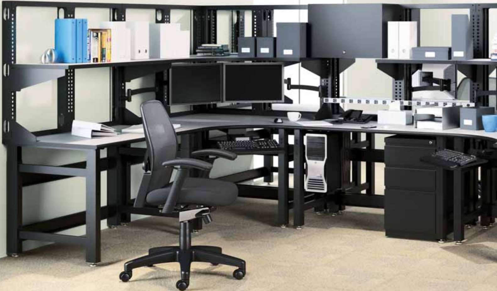
TechWorks system with Nebula Gray HPL laminate and Textured Black paint.