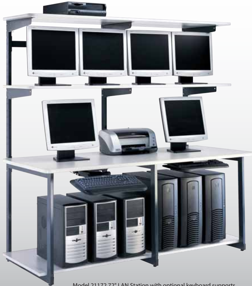
Model 21172 72" LAN Station with optional keyboard supports