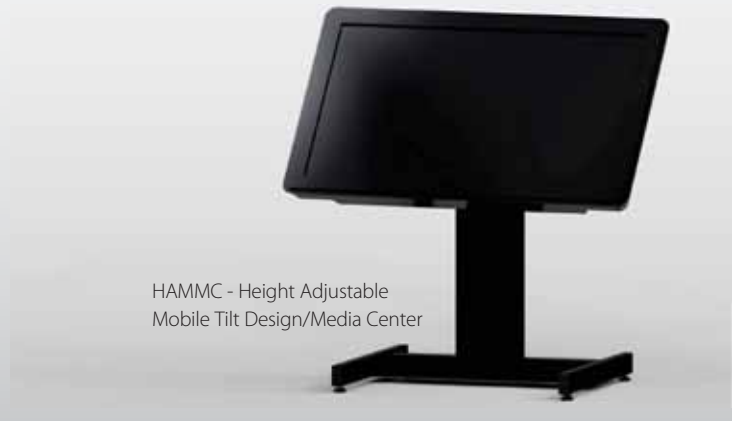
HAMMC - Height Adjustable Mobile Tilt Design/Media Center