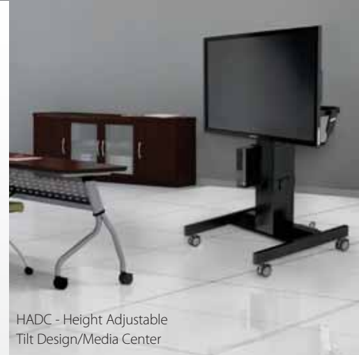
HADDC - Height Adjustable Tilt Design/Media Center

Brackets may show if screen is smaller than 40"; varies with VESA pattern location.