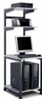
21124 24" LAN Station with optional casters