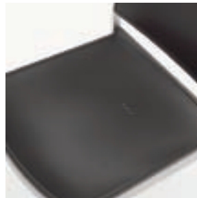
Perforated holes for outdoor drainage