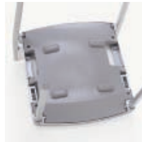
Underside of chair