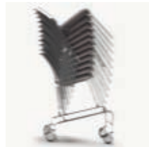
Corfu caddy for stacking and storage