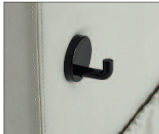
Catheter hook option