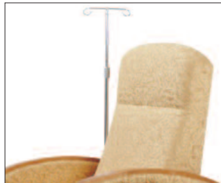
IV pole option