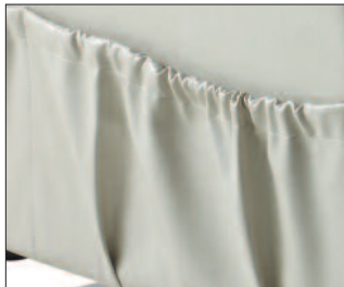
Magazine rack option

Available with upholstered or wood arm caps.