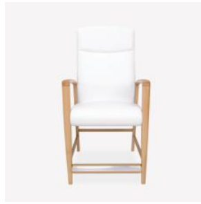
21" Patient, Open Arm JOR2-HP21OPS