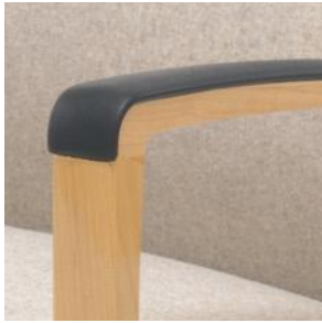
Urethane Arm Cap