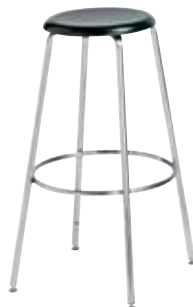
Series ST 30"