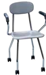
Series TC with arms