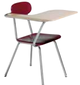
Series 90 belly room - 14"