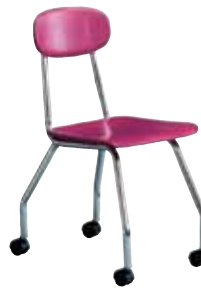
Series TC armless