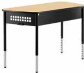
Series 50 laminated top 48" width