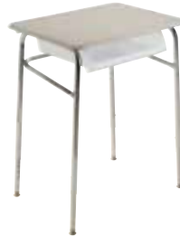
Series 40 w/book box