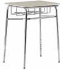
Series 40 w/book basket