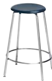
Series ST 24"