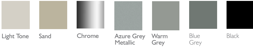
Light Tone Sand Chrome Azure Grey Metallic Warm Grey Blue Grey Black