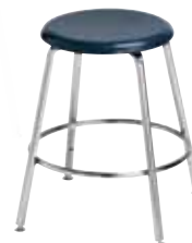
Series ST 18"