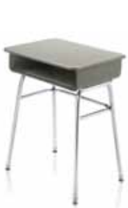
Series 20 open front