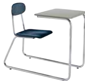
Series 58 belly room - 16"