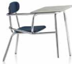
Series 61 belly room - 14"