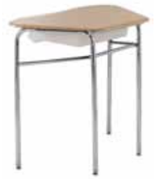
Series 60 w/book box