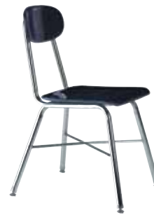
Series 10 X-Brace