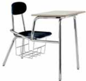
Series 56 w/book basket belly room - 15"