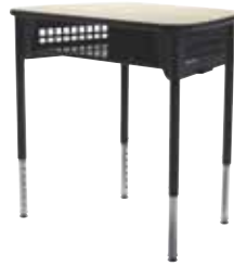
Series 50 laminated top 30" width w/book tray