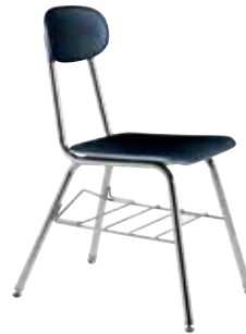
Series 10 w/ Book Rack