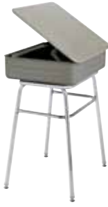
Series 30 lift lid