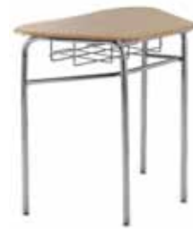
Series 60 w/book basket